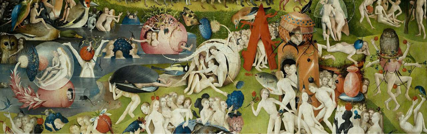
The Garden of Earthly Delights (detail) by Hieronymus Bosch (1490-1500) at the Prado Museum Madrid