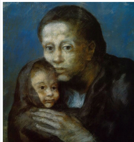
Photos (from top): Sorolla Museum (YOYU); Sagrada Família, Barcelona; The Disinherited Ones by Pablo Picasso (1903) at the Picasso Museum