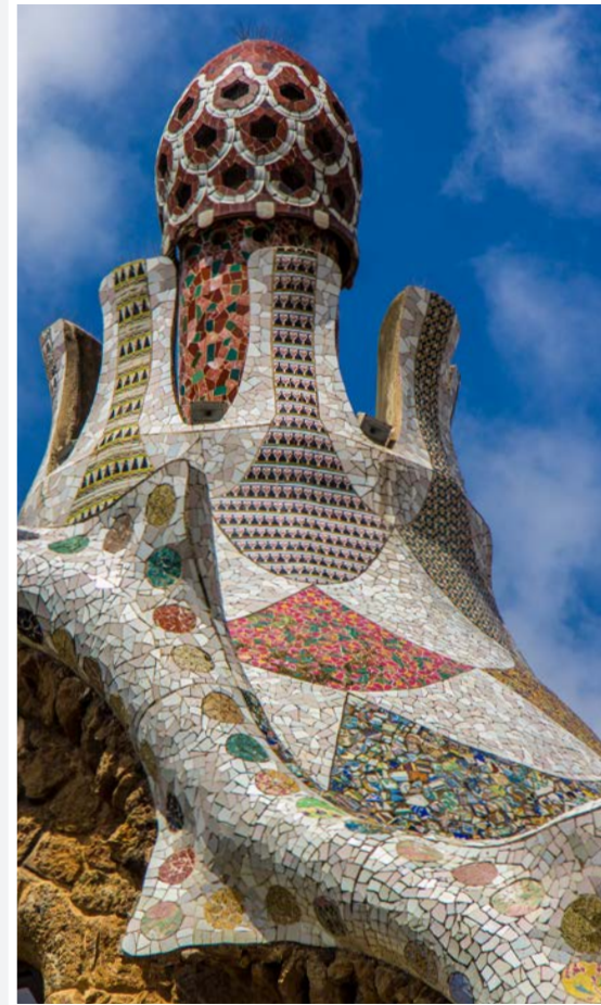
Park Güell Entrance Confection (Andrew Moore)