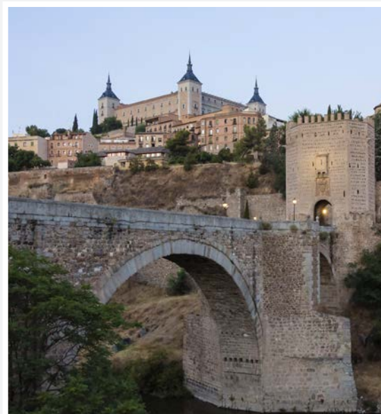
Photos (from top): Plaza Mayor, Madrid ; Burial of the Count of Orgaz by El Greco (1586-1588) at the Church of Santo Tome; Castilla La Mancha, Toledo